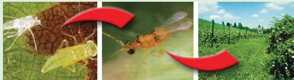
The pest (grape leafhopper, left picture) is killed by a natural enemy (parasitoid, centre) which moves in from its habitat in a hedge of wild roses.