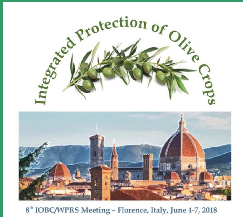
8 th IOBC/WPRS Meeting - Florence, Italy, June 4-7, 2018